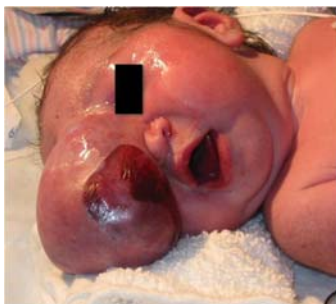
Figure 5: Gross image demonstrating the midline mass extending through the frontal and nasal bones, compatible with a large frontonasal encephalocele.