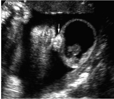
Figure 3: Coronal transabdominal image through the nose (arrow) and lips (L). Note the well circumscribed cystic lesion superior to the nose with internal tissue, compatible with brain tissue herniating into a frontonasal encephalocele.

parenchyma herniating into the prenasal space. Also note increased space between the orbits compatible with hypertelorism.