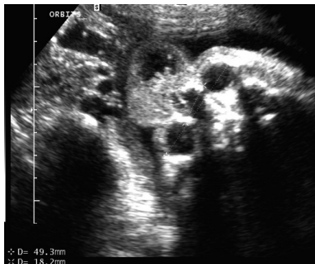
Figure 2: Transabdominal axial image through the orbits and base of the nose demonstrates a midline cystic mass with internal echogenic material, which appears isoechoic to the adjacent brain